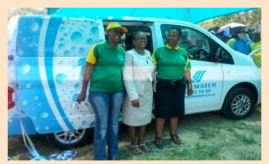
The principal of Siloe School for the Blind (in the cream suit) with some of the educators in front of the MV combi donated by Rand Water in partnership with Limpopo Nissan BB Auto.