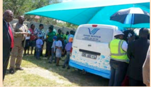
The Nissan MV 2000 Combi donated to Siloe School for