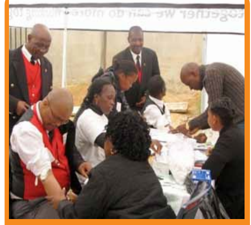
The Young Men's Guild of the Methodist Church of Southern Africa Amadodana ase Wesile, were also tested.

The main objective of the campaign was to bring<br/>health services closer to the people, encourageCommunal points such churches are key to bring<br/>government services closer to the people.