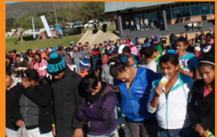
As Mayor Mitchell opened the day's festivities with prayer, young people bowed their heads.