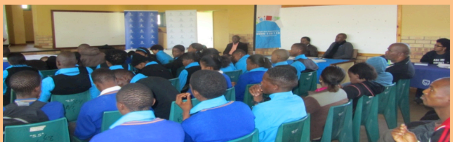
Learners from the Greater Taung Local Municipality were given information on career and financial opportunities.

As part of the Youth Month activities in the Greater Taung Local Municipality, learners from secondary schools in the area were given a chance to interact with different tertiary institutions and government departments to get more information on career and financial opportunities. The career exhibition was held at Ba Ga Phuduhucwana Tribal Hall in Taung Central on 14 June 2013. The exhibition promoted a key issue highlighted in the Youth Accord, namely skills development. It stated that "children must go to school and arm themselves with education, because there is no substitute for education".