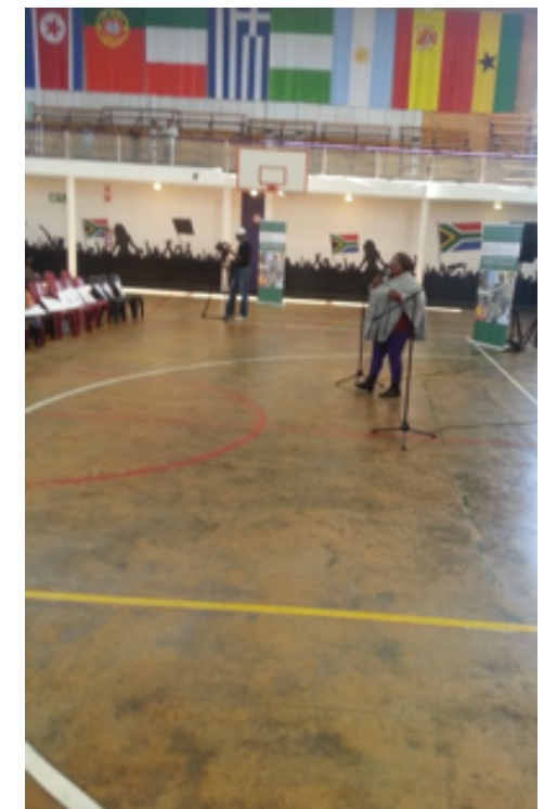
Young people attending the event was mobilised to help fellow students and friends seek help for drug and substance abuse.