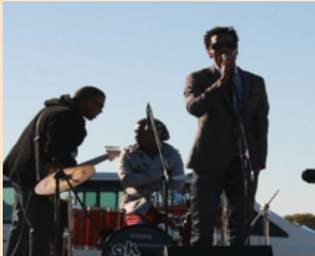
Idols sensation Gift Gwe kept the crowd on their feet.