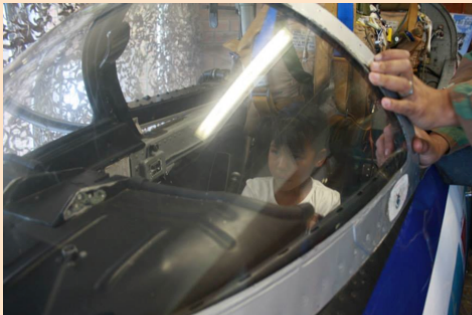
One of the younger festivalgoers was fascinated by all the gadgets in an aeroplane cockpit, displayed by the South African National Airforce.