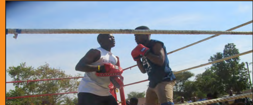
Amateur boxers exchanging blows at Dikebu Boxing Palace.