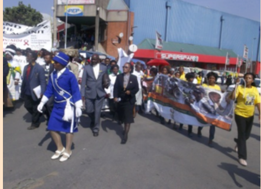
Faith-based organisations and civil society take centre stage in partnership with government.