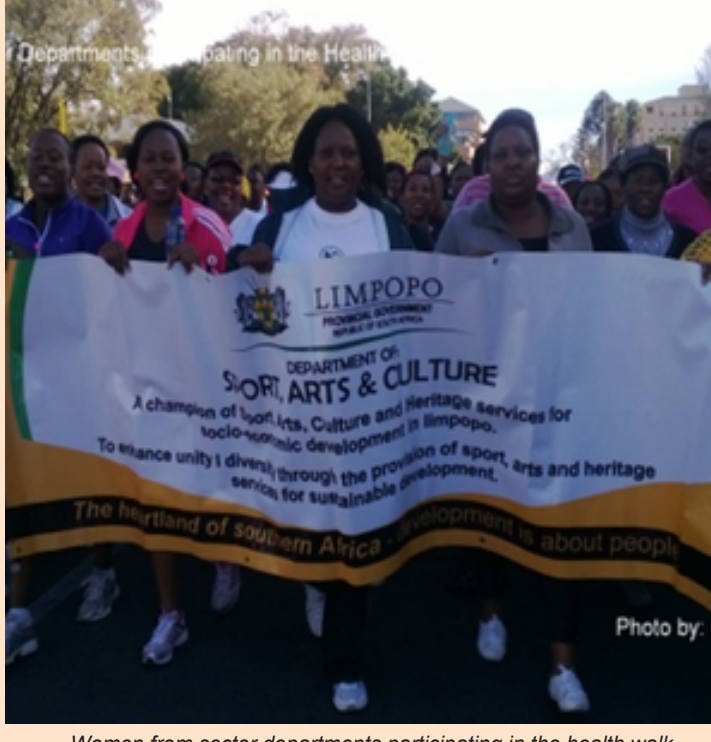
Women from sector departments participating in the health walk.

It was a sunny Friday morning during Women's Month when women from various government departments in Limpopo took to the streets of Polokwane for a walk aimed at encouraging women to adopt a healthy lifestyle.