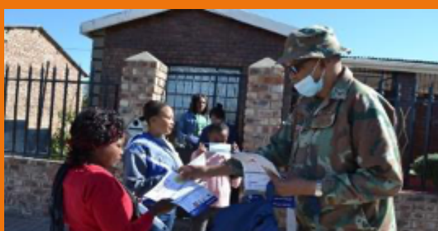
An SANDF member distributing information material and masks in Oudtshoorn.