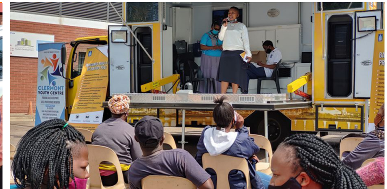
Stakeholders rendering services to the community at the Archie Gumede Thusong Service Centre.