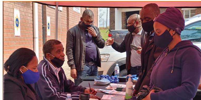
Stakeholders rendering services to the community at the Archie Gumede Thusong Service Centre.