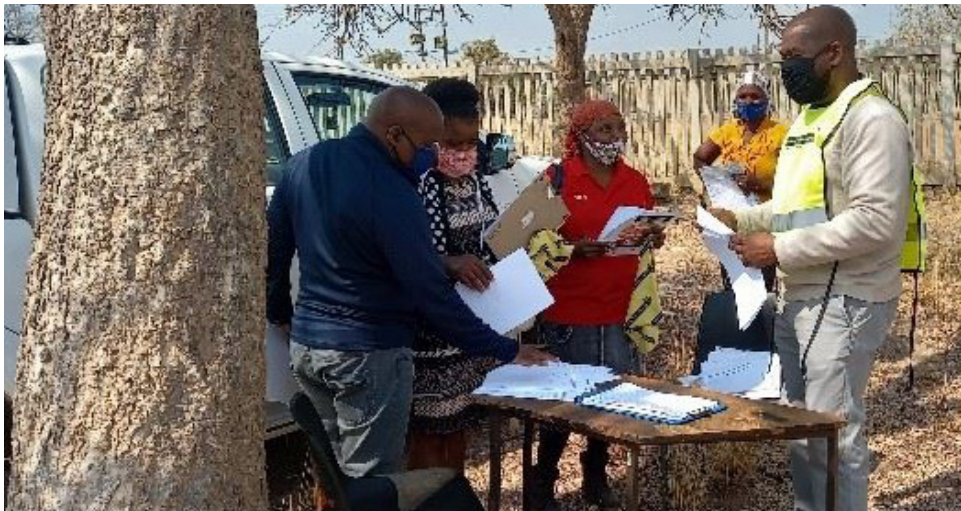
A government official interacting with community members.