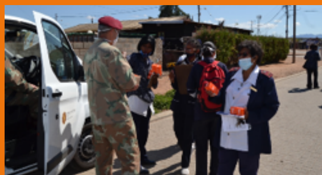
Health officials distributing medicines in Oudtshoorn.