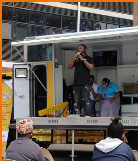
An official from the City Integrity Unit addressing the audience.