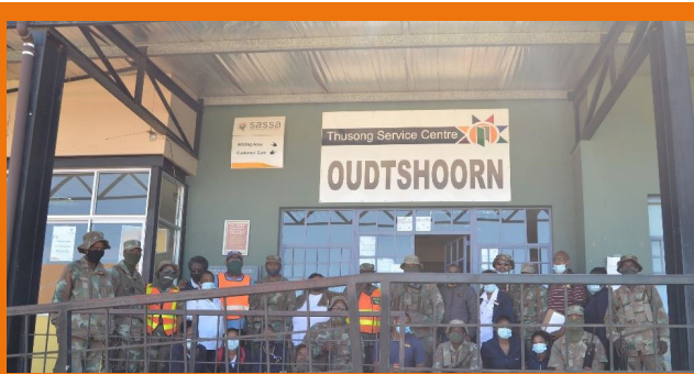
Stakeholders who participated in the Annual Thusong Service Centre Week activities in Oudtshoorn.

SANDF members handed out masks to people who were not wearing any. Fever and cough medicines were given to mothers with children under the age of 12 years old.