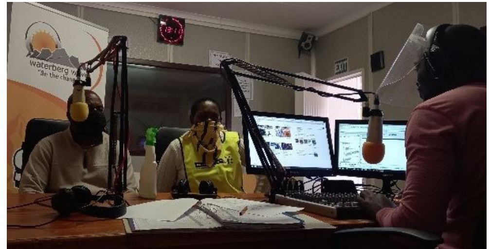
A government official at the Waterberg Waves Community Radio Station.