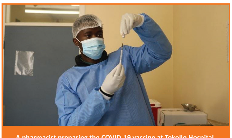
A pharmacist preparing the COVID-19 vaccine at Tokollo Hospital.