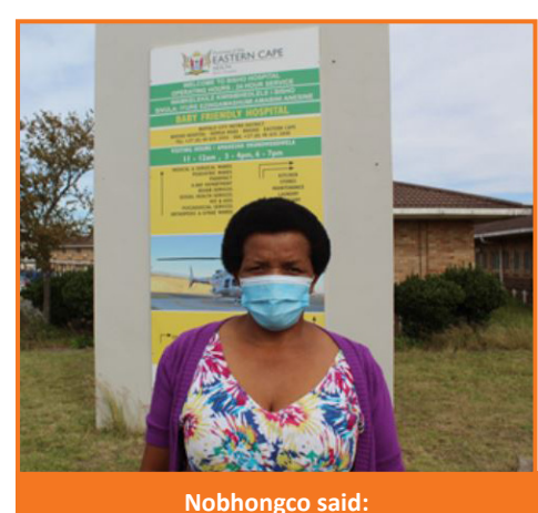
"I was very scared to be vaccinated, as so many stories were told about this vaccination. When I came here the nurses explained the process to me. I got vaccinated and nothing is wrong with me. I encourage other elders to come for the vaccination so that they can be safe."