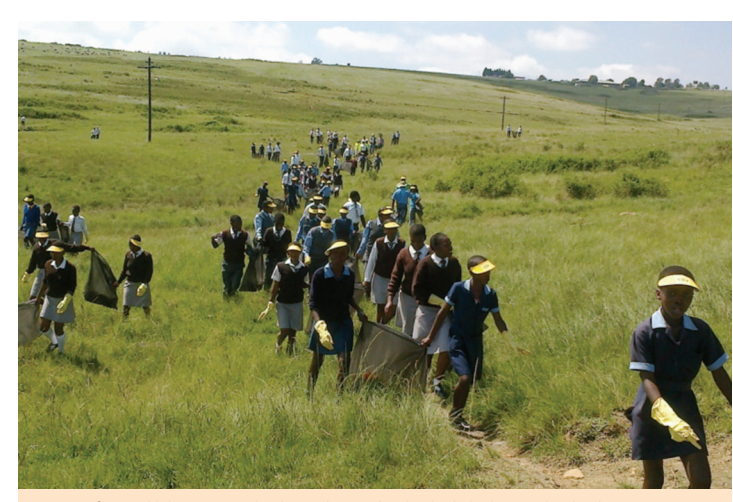
Learners from Sakhile Primary School, Emtshezi High School, Bhekathina High School, Estcourt Senior High School and Good Home High School cleaning the environment.