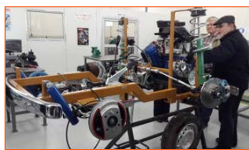
This model will be used to train future mechanics.