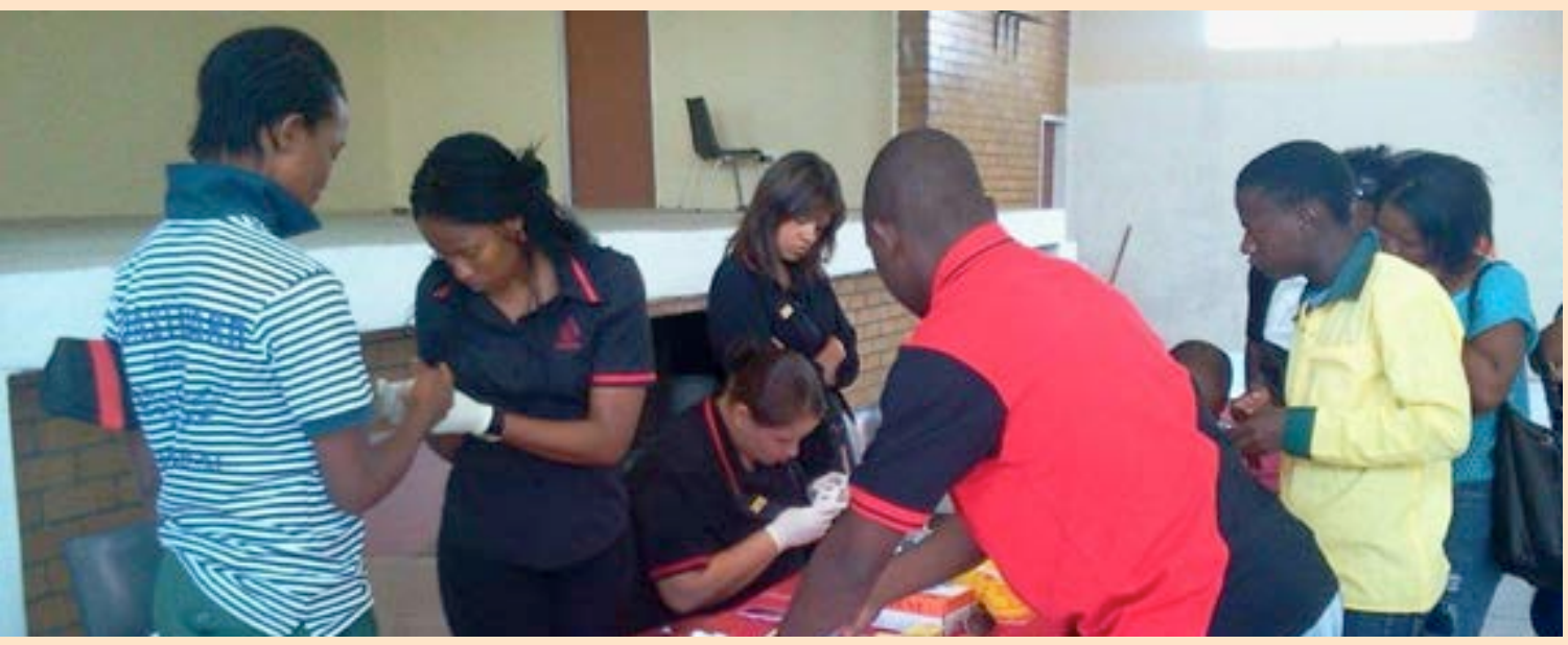
Officials from SANB perform health screenings on community members before donating blood.