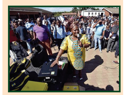
Minister Faith Muthambi addressing attendess at the event.