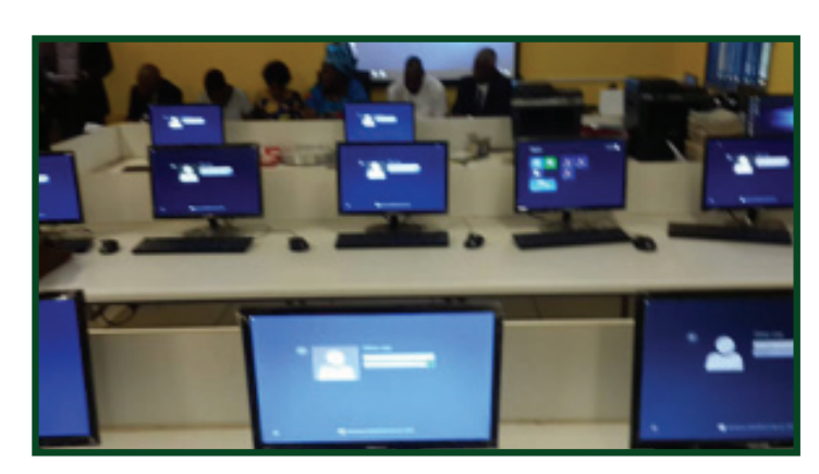
Kolokoshani High School computer lab.