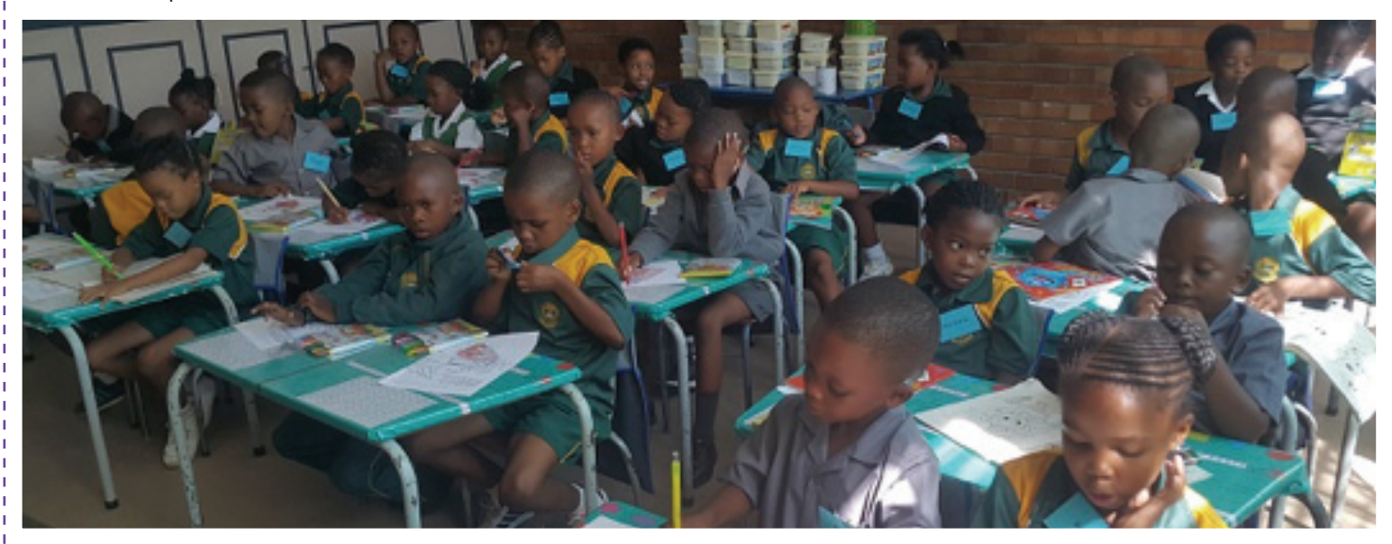
The Grade 1 English class of Sentral Primary School.

Sentraal Primary School admitted 161 Grade 1 learners for English and Afrikaans classes for the 2017 school year. Although some of the learners have started their Grade 1 classes very smoothly and with jubilation, there were other children who found it difficult to adapt to the new environment, especially a formal classroom setting. Some of them were crying while others indicated that they wanted to sleep.