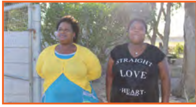
Two community members ahead of the screening of the SoNA.

The tranquil seaside town of Elandsbaai welcomed Government Communication Information and System into their community for a live viewing of the State of the Nation Address (SoNA) on 9 February 2017. This year was the first time that Elandsbaai hosted a live viewing and Elgelbreacht Primary School was the perfect venue for the screening to take place.