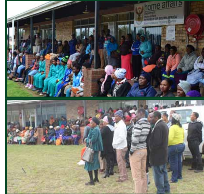
The community of Dannhauser attended the event to listen to their leaders.