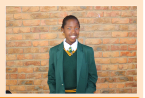
When asked what her thoughts were concerning the whole programme, this learner said she found the session to be very informative and that she has learned more about children's rights and responsibilities. She also said the leaflet that was provided was very helpful.