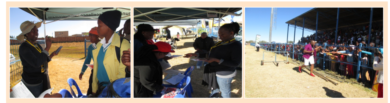
The Department of Communications distributed Youth Guides to the youth.

Government has set aside R20 million to roll out a massive skills-development programme targeting the youth. This programme relates to the provision of both financial and non-financial support to young entrepreneurs.