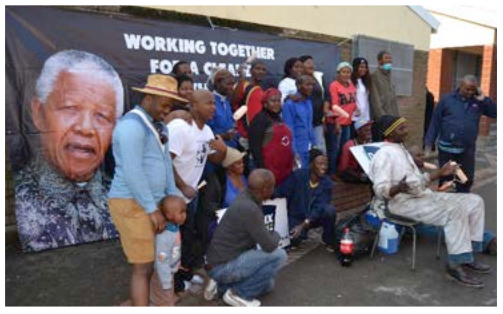
Community members at the event.