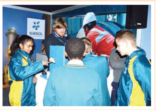
Learners exploring various ways to generate electricity.