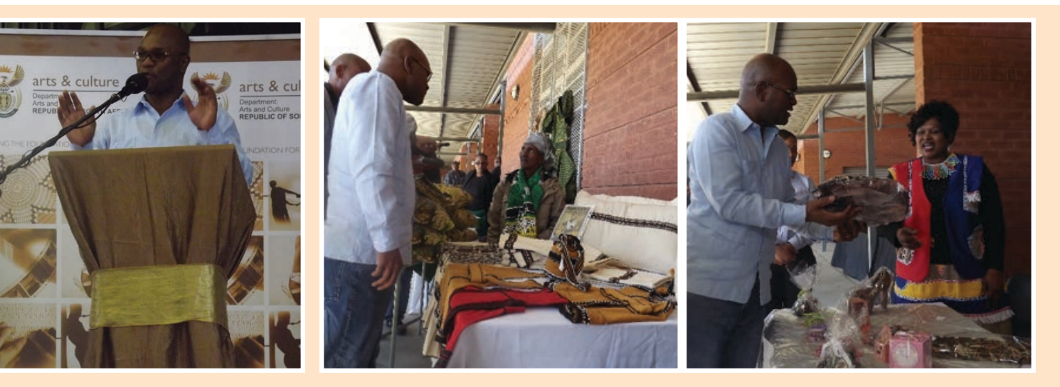
Minister Mthethwa speaking at the event.

By Mojalefa Senokoatsane: GCIS, Free State