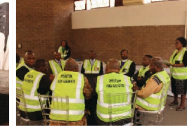
Department of Social Development Premier officials presenting blankets to needy families. presenta