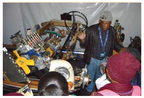
Motor mechanic engineering was also part of the field of study that learners were ecouraged to explore.

Sasol has been sponsoring Sasol TechnoX for 14 years. The event has grown in popularity to become the largest career guidance exhibition in the inland provinces. Last year, over 24 400 visitors attended the expo in Sasolburg in the Free State. This year's event took place in Secunda, Mpumalanga from 3 to 7 August 2015. This initiative was a first for the region.