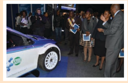
MEC Mhaule viewing the new fuel efficient race vehicle designed by Sasol.