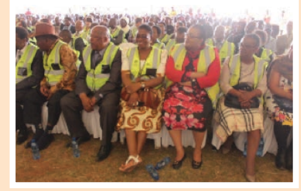
Government leaders and other dignitaries at the launch.