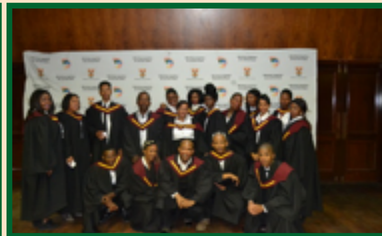
Young people from George who graduated through the Tourism Learnership

In the 2014/15 financial year, a budget was approved to train 540 learners in the Western Cape in a 12-month learnership programme called the Tourism Buddies Learnership. The training comprised 30% theory and 70% practical in which learners were placed at various hospitality establishments within the province. The enrolled learners were trained on one of the following qualifications: