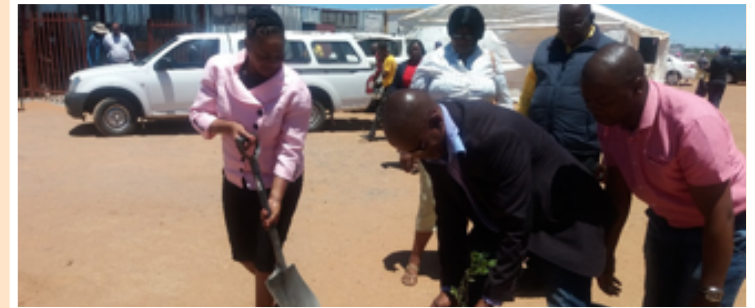
The Executive Mayor planting a tree.

About 100 people with disabilities attended the launch of the Disability Month programme under the theme: “South Africa – a free and just society inclusive of all persons with disabilities as equal citizens”. The event took place on 4 November 2015 at the Ba'One Intellectual Disability Centre in Seeding.