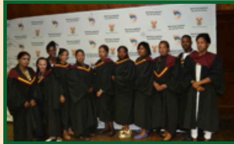
Young people who graduated through the Tourism Buddies Learnership.

“We are confident to say that the participation by civil society and government helped us to achieve Outcome 3, which is job creation. The media is not excluded from this, hence their presence here today. Tourism contributes about 10% to our gross domestic product, and this learnership programme contributed to job creation, with 128 learners receiving permanent employment,” said the Deputy Minister of Tourism, Tokozile Xasa.