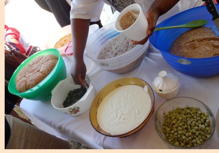
Afican cuisine display during Heritage month celebrations.

KwaSani Municipality held its third annual Cultural and Food Testing Expo in Hime-ville, KwaZulu-Natal in September 2013, to mark Heritage Month.