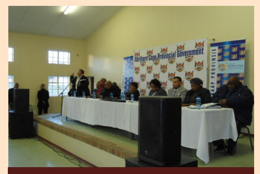
Members of the Northern Cape Executive Council responding to the issues that arose in Calvinia.

Grade R enrolments have more than doubled between 2003 and 2011.