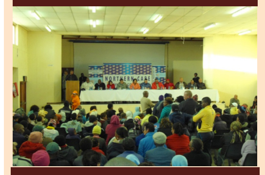
Community members of Fraserburg raising their concerns with the Northern Cape Government.