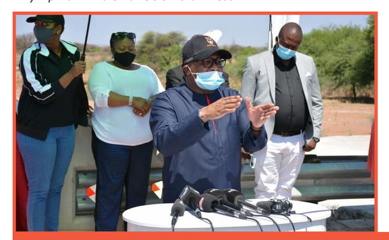
Transport Minister Fikile Mbalula at the official opening of Madidi Bridge.