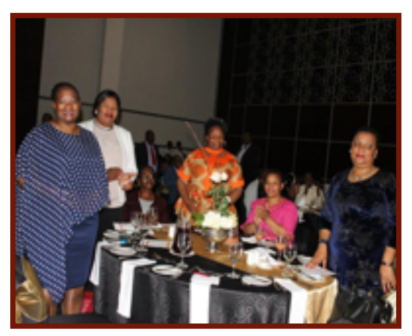
Executive Mayors were requested to stand up.

The month-long programme, which kickstarted on 5 September 2016, will be rolled out to all district, metropolitan and local municipalities in the Eastern Cape.