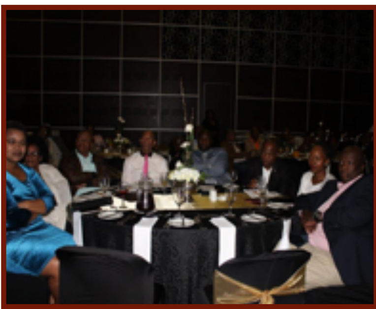
Emalahleni Local Municipality Mayor seated with government leaders from other municipalities.