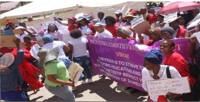
Intsika Yethu march marking the closure