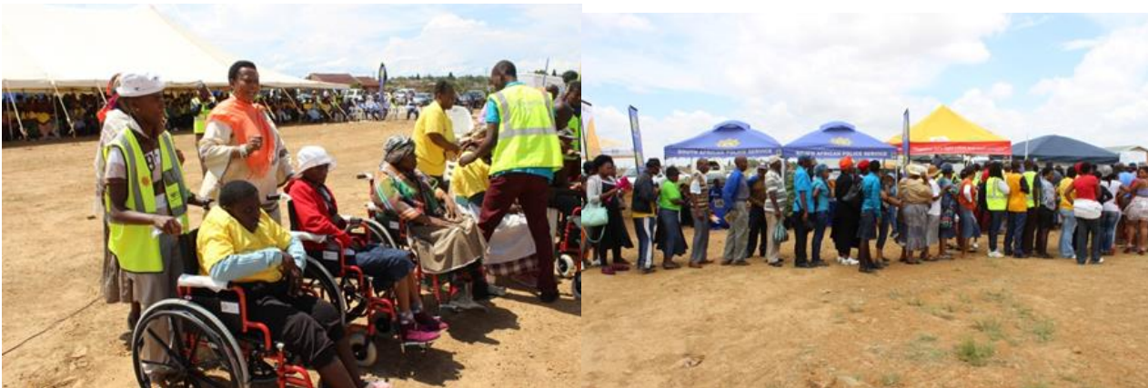
The MEC for the DOE assists in issuing out of wheelchairs to the rightful owners and the community members queuing to consult at the government stalls.