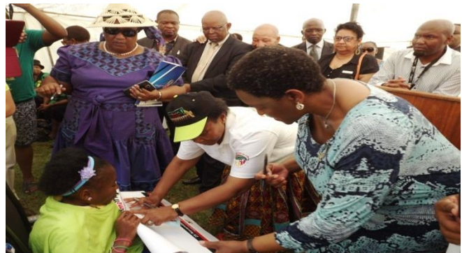
Minister Susan Shabangu and Minister Bathabile Dlamini signing the memorandum with MEC Sisi Ntombela looking on