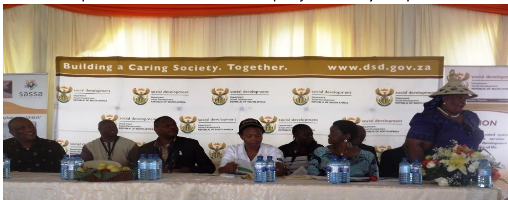
From left: MP Mr Madala Ntombela, Mafube LM Chief Whip, Cllr Mosia, Mafube LM Mayor Cllr Sigasa, Minister of Women Me. Susan Shabangu, Minister of Social Development Me. Bathabile Dlamini and MEC for Social Development Me.Sisi Ntombela and other dignitaries at the 16 Days of activism even held in Frankfort.

On the 03rd of December 2014, The National Department of Social Department together with the Free State Department of Social Development and The National Department of Women hosted a commemorative 16 Days of Activism against Women and Children. The event was held in Frankfort, located in the north/east tip of Fezile Dabi District Municipality of the majestic province of the Free State.