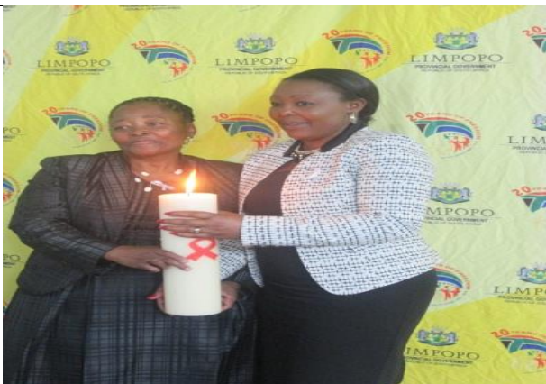
Executive Mayor of Waterberg with the MEC for Safety, Security and Liaisons during the candle lighting moment as part of the provincial launch of 16 days of activism on the 25 November 2014