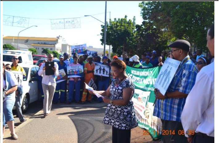
Community members waving their posters in the fight against the abuse of women and children in the community The Deputy Mayor of the Matzikama municipality read the submission made to the Department of Justice in the Matzikama Municipality