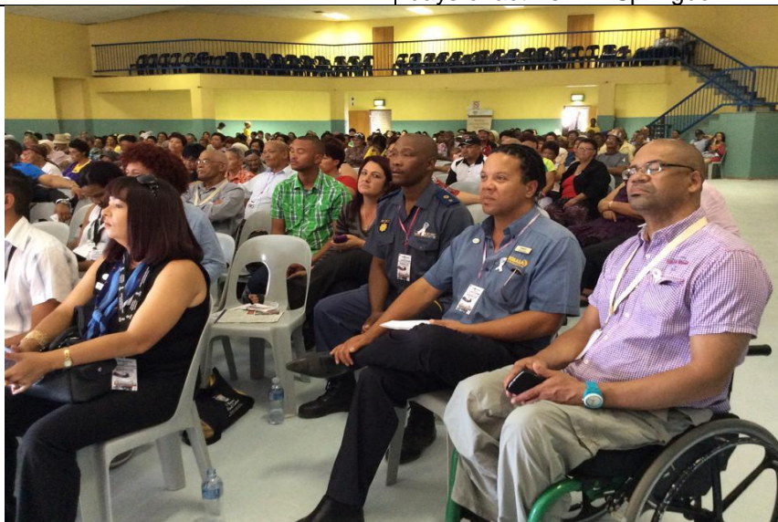
Attendants during the closing of the 16 days of activism event in Springbok