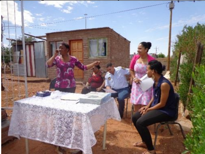
Some of the departmental representative during the 16 days event in Louisville