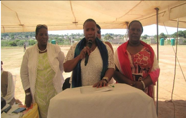
The mayor of Elias Motsoaledi Local Municipality during 16 days of activism of no violence against women and children at Ntwane village on the 04 December 2014.