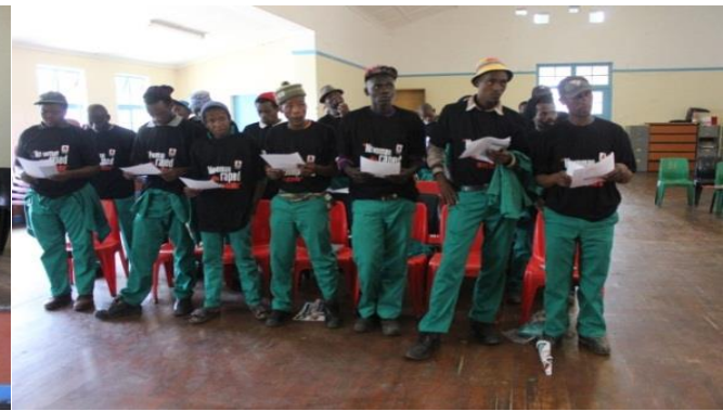
Men pledging to be counted in during a dialogue post the march in Engcobo