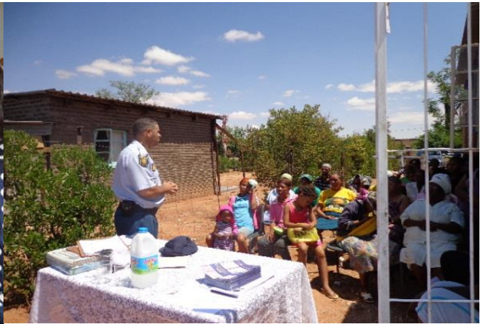
SAPS representative during 16 days event in Louisvale