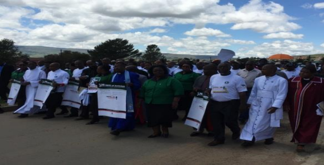
Men's walk led by the Premier Phumulo Masuale in Maluti in Matatiele Municipality.