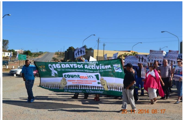
SAPS signing of on the submission in regards to the fight against abuse Community members start with the March from Vredendal north to the centre of town