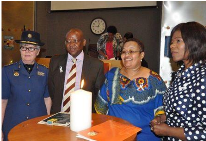
NC Premier Sylvia Lucas the Public Protector during the opening event of the 16 days of activism