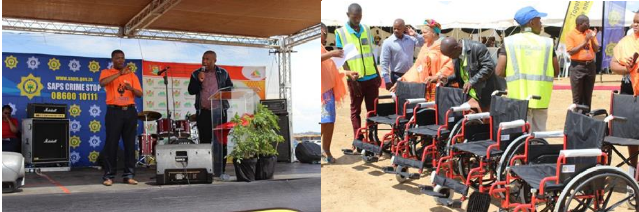
The MEC for DCSSL during his keynote address and the MEC for Social Development issuing out the wheelchairs donated to people living with disabilities.

On the 29 th of November 2014 the Department of Social Development's national office partnered with other stakeholders provincially and locally and embarked on the exercise that was aimed at emphasising government's position on the act of no violence against women and children.