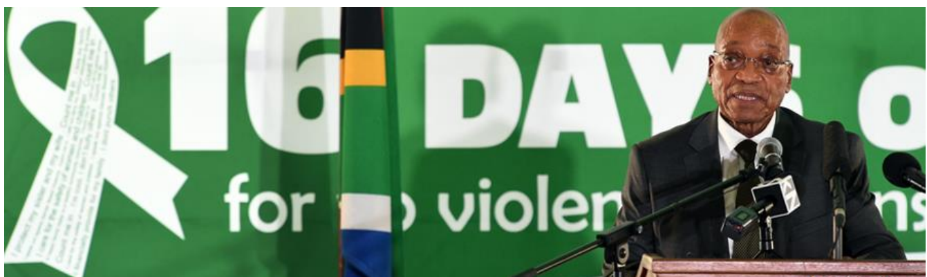
President Jacob Zuma delivering his keynote address

President Jacob Zuma, visited Reiger Park for the launch of the 2014 '16 days of activism for no violence against Women and Children' Tuesday 25 November 2014.