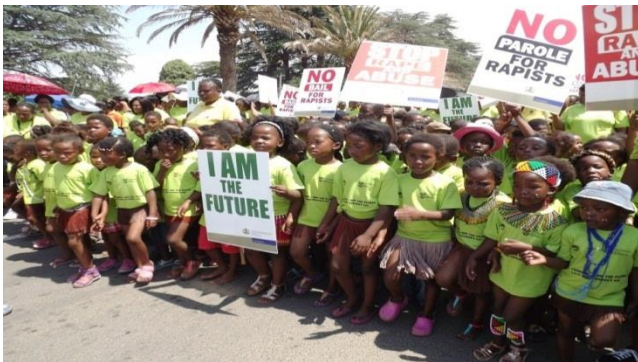
Children marching through the streets of Frankfort to deliver their "Count Me In" Memorandum