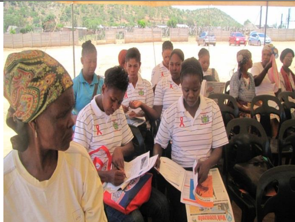
Part of the community members during 16 Days of Activism of no violence against women and children at Ntwane village, Elias Motsoaledi Municipality on the 4 December 2014.