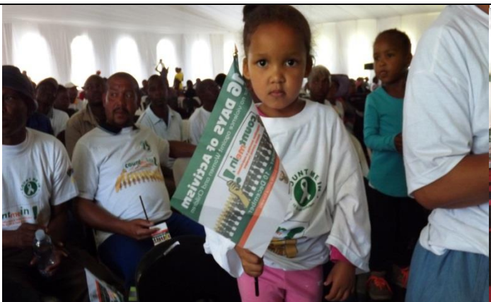
Community of Reiger Park turn-up in large number to listen to President Zuma's message on 16 Days of Activism and be counted in to work towards a moving a non-violent South Africa forward.