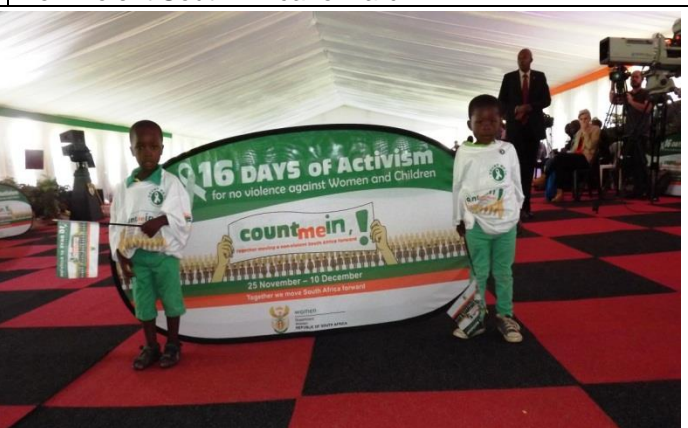
Reigerpark young and old came in numbers to witness the launch of 16 Days of Activism for no violence against women and children and to be counted in