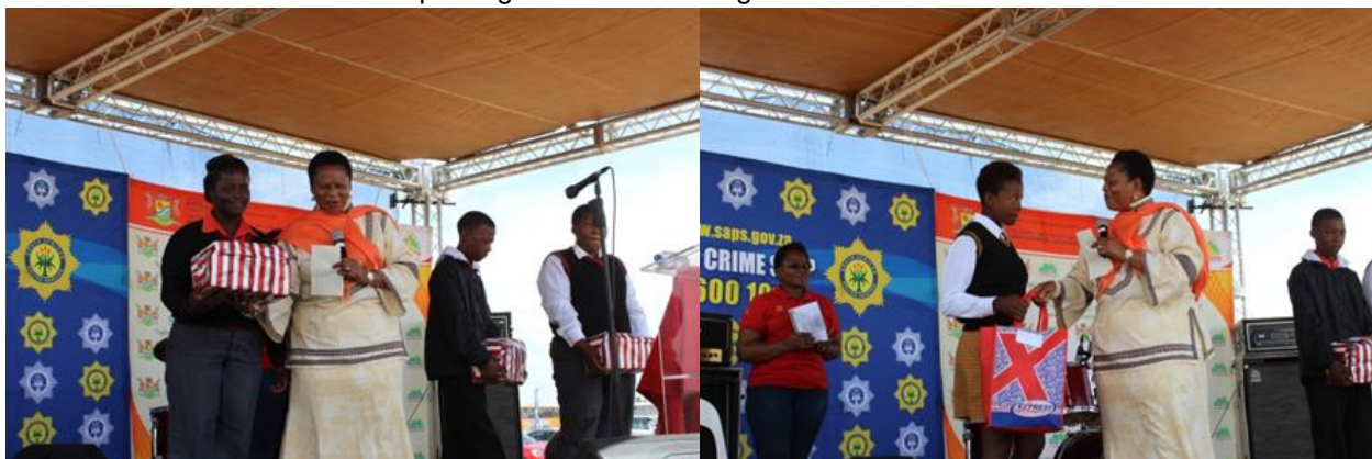
The MEC for the DOE issuing out school uniform to the learners