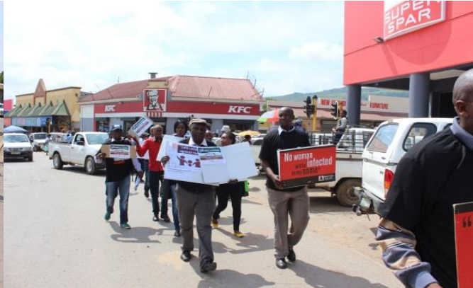
Men's march in Engcobo to mark the closure