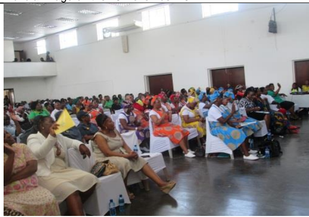
Community members during the launch of 16 days of activism at OR Tambo community hall at modimolle on the 25 November 2014