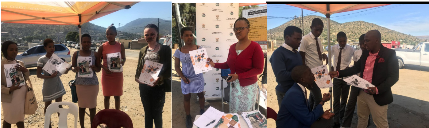
GCIS officials encouraging Msinga community at the Tugela Ferry Thusong Service Center, to follow 2018 Communications Budget Vote speech.