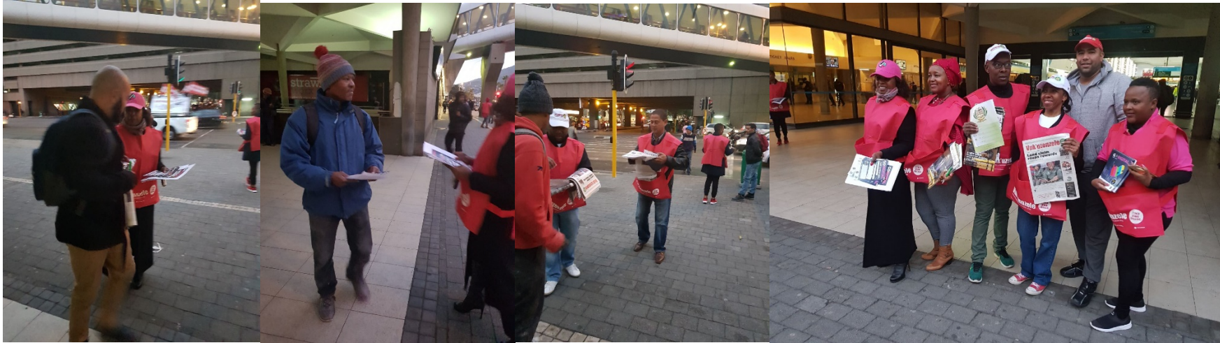
Pre- DoC Budget Vote activation at Cape Town Railway Station.