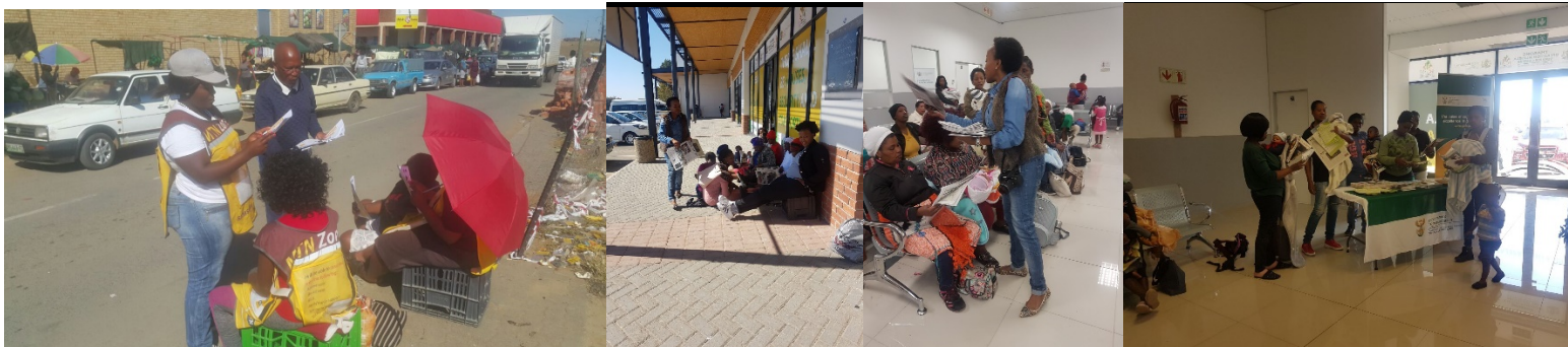
Activation at Boitumelo mall in Welkom to encourage people to watch the Budget Vote.