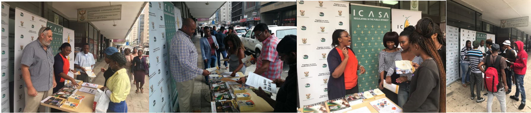
GCIS exhibited outside its provincial office at Joe Slovo Street in partnership with ICASA and Media hub as part of Budget Vote activations.