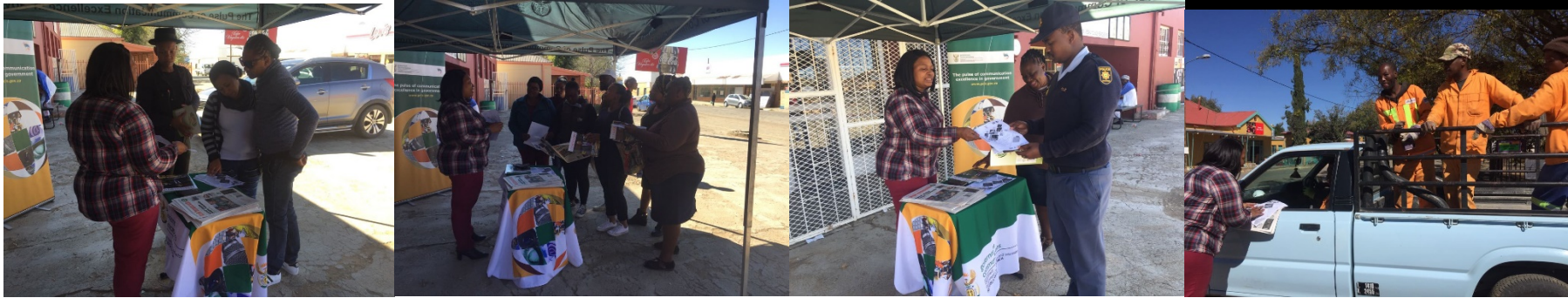
Activation in Trompsburg to mobilise people to watch DoC Budget Vote.