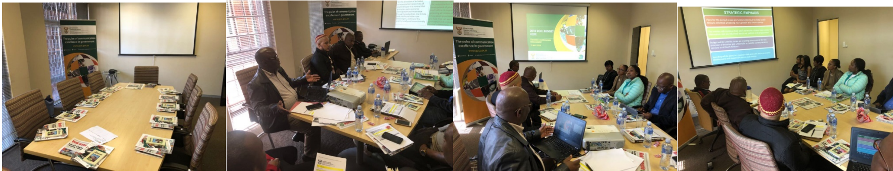
Stakeholder engagement session at Emalahleni. GCIS provincial director engaging with engaging stakeholders as part of the Budget Vote networking session.