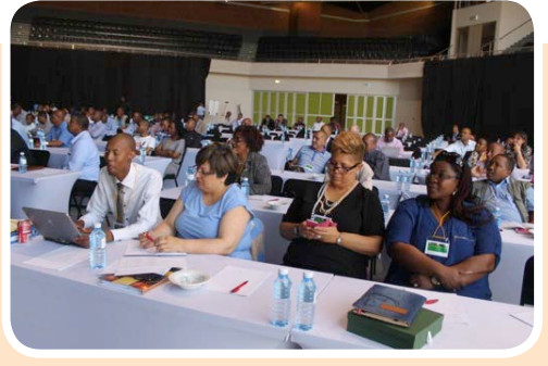
Officials of the Department of Mineral Resources and mining houses representatives.