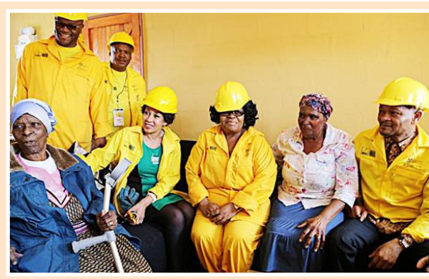
Minister Lindiwe Sisulu of Human Settlements together with Premier Mchunu and Deputy Mayor of eThekwini Municipality, Nomvuso Shabalala handing over a house to the Nene family in Ilovu as part of the Women's Build Programme.