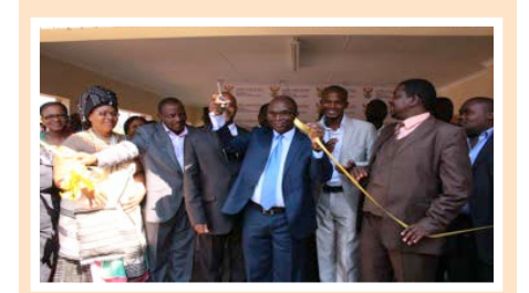
Deputy Minister Magwanishe cuts the ribbon, surrounded by different dignitaries.