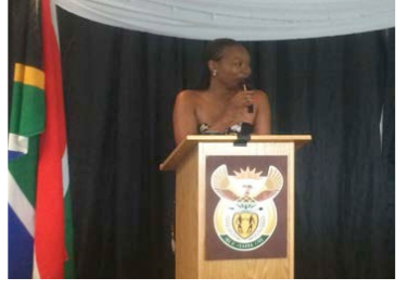
Deputy Minister Ndat