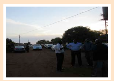
People leaving the Chabane home after a church service.