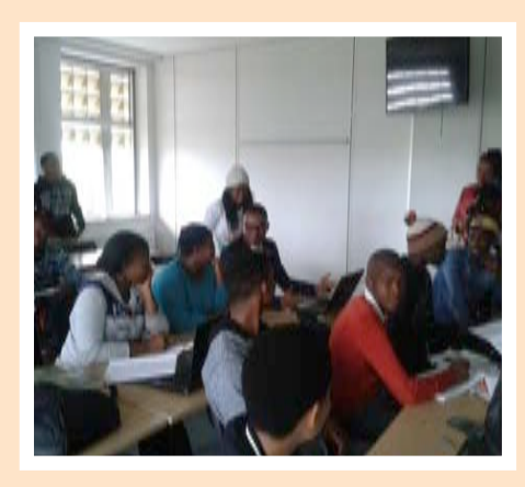
Students in one of the lecture halls.