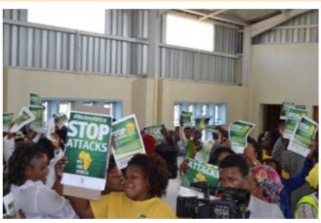
Deputy Minister of Communications, Stella Ndabeni-Abrahams, reaching out to community members in East London, Eastern Cape.