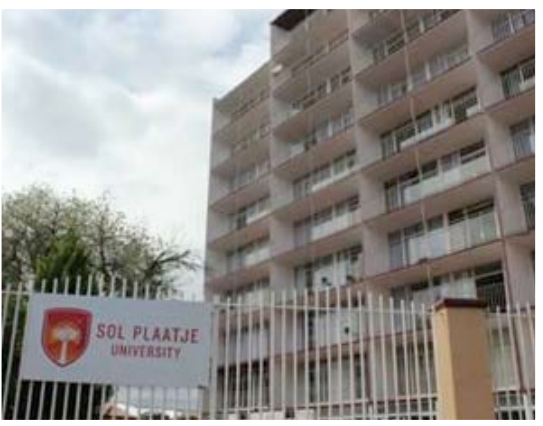
Student residences at the SPU.