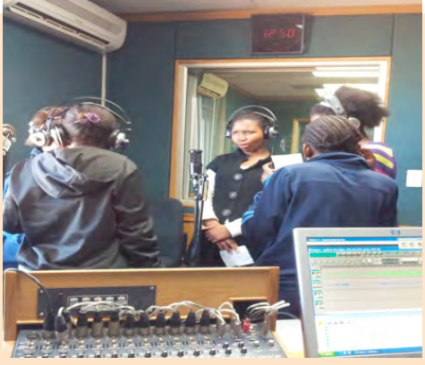
These children are recording music that will be played on the station.

The station plays an important part in the community to preserve the !Xhu and Kwe languages of the San and reconcile two tribes who historically did not to see eye-to-eye.