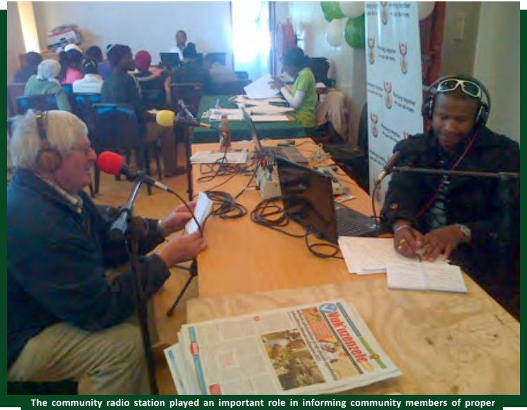
conduct during protest action.

The local GCIS office recorded an information radiospot about the roles and responsibilities of protesters, which they broadcast for two weeks on the community radio station. The aim of the radiospot was to get protesters to protest peacefully, and not to steal and vandalise government and private property. The message also included contact details of the South African Police Service, the Department of Labour and the GCIS district office. The community radio station reaches three municipalities and has a listenership of 140 000.