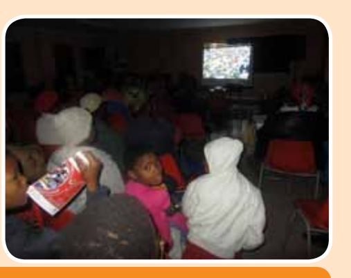
SoNA live screening in Rekgaratlhile Secondary a Stella Village.