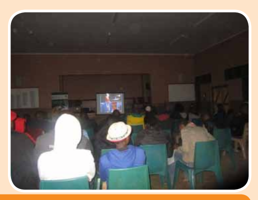
MEC Phosa of the Mpumalanga Department of Economic Development and Planning, introducing stakeholders.