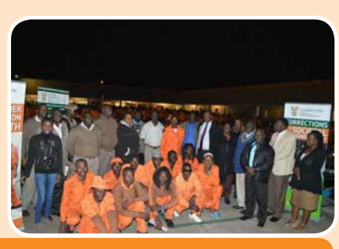
MPLs, Cllrs, Centre management and inmates after the President's speech.

Political Principals at the Thohoyandou viewing sit