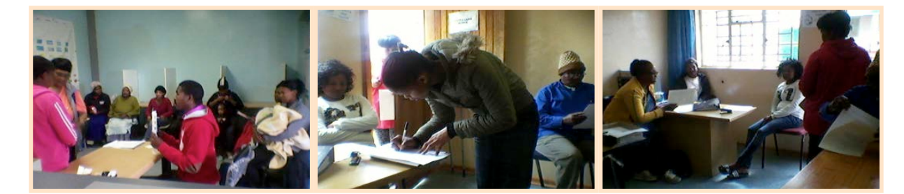
Community members applying for identity documents and birth certificates at the event.