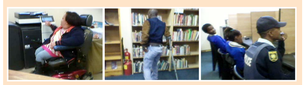
Social workers assisting people with disabilities.