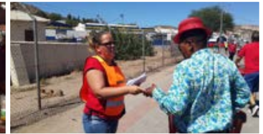
GCIS officials and other stakeholders distributing information products to community members.