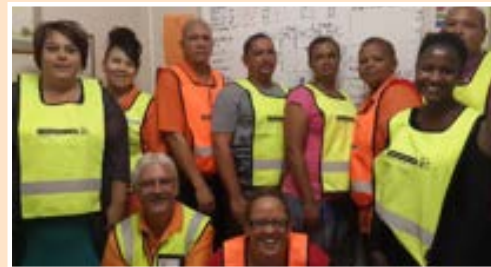
The GCIS team ready to take to the streets of Springbok.