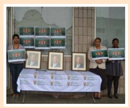
DoC staff outside the Eastern Cape Provincial Office.