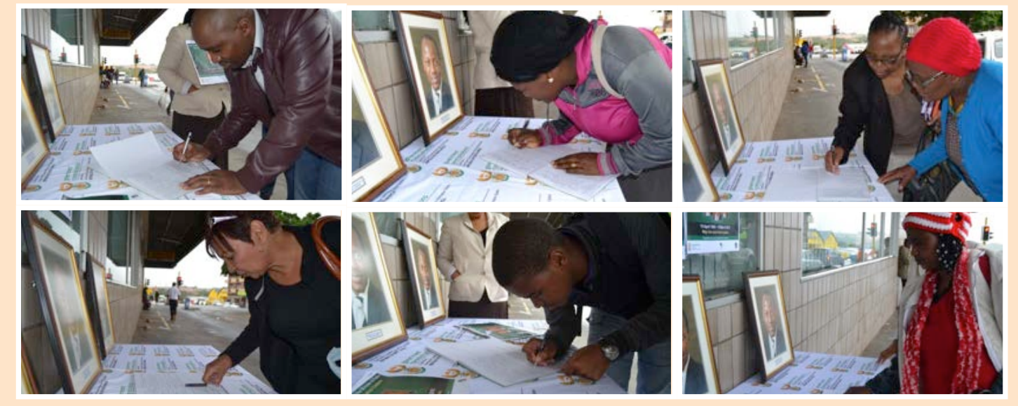
Members of the public writing their messages of support and also signing the condolence book.

"May your soul rest in peace." – N Pinyana