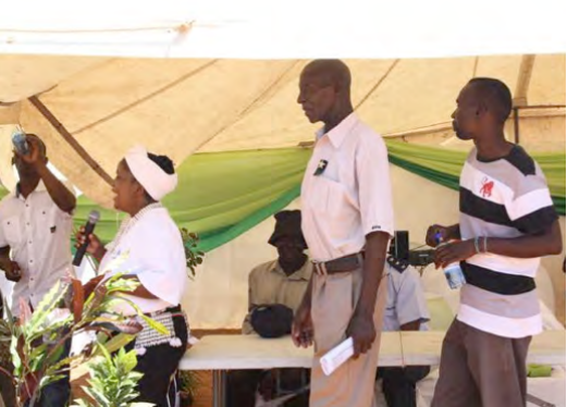
Residents of Ba-Phalaborwa raised concerns about the lack of service delivery at an Imbizo held at Mashishimale.

During the event, different stakeholders from the community voiced their concerns and addressed their needs. Cllr Sono responded to their concerns by presenting a progress report for the 2013/14 projects in the Integrated Development Plan (IDP). She highlighted the progress of projects such as: the provision of household refuse removal services, which is at 67%; six projects were implemented through the Extended Public Works Programme; 140 jobs were created through municipal activities; hawkers were assisted with the