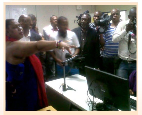
The Deputy Minister of Women, Children and People with Disabilities demonstrating how the computer for blind people works.

Government has been putting measures in place to reach 2% of people with disabilities in the public service by 2015.