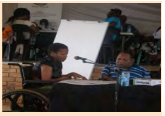
Ms Thandeka of Mdladla Centre for Disabled People sharing her views on municipal transformation.

The Constitution of the Republic of South Africa ensures that every South African with a disability has the right to life without discrimination and be treated as an equal citizen.