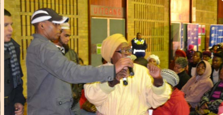
A community member from the Zwelethemba Community spoke about her issues regarding the Criminal Justice System and how women need more protection from government.

Amidst the stormy rainy weather, hundreds of community members of the Breede Valley Municipal area attended the Crime Prevention Women's Month programme, which was led by the Justice, Crime Prevention and Security Cluster (JCPS).