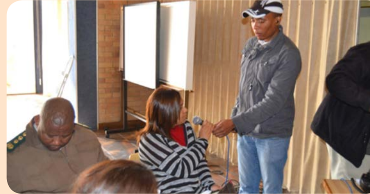
Community radio interview with provincial heads of the departments of justice and correctional services organised by the GCIS.