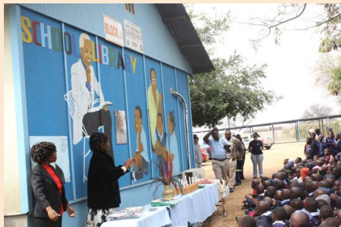
The Deputy Principal of Ntshunshakani Primary School addressing learners during the handover of paints and painting material by Foskor Mine and Komatsu Company at Lulekani in the Ba-Phalaborwa municipality.