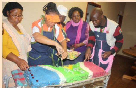
After the hard work, a celebration cake was cut.