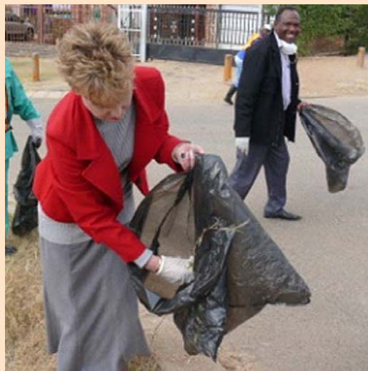
All took part in cleaning Mapodile's streets.