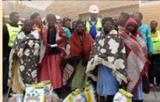
Senior citizens came in numbers to support the good cause and were given blankets.