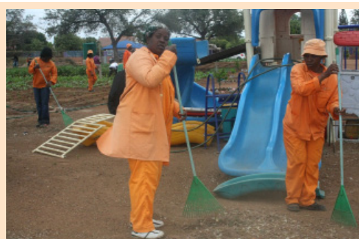
Members of the Community Work Programme cleaning the yard of the Ntabiseng Special School in Namakgale.