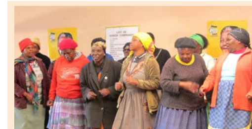
Some of the choir members rendering musical items to entertain the crowd.

Among other donors were MMC Mining Company as well as Woolworths.