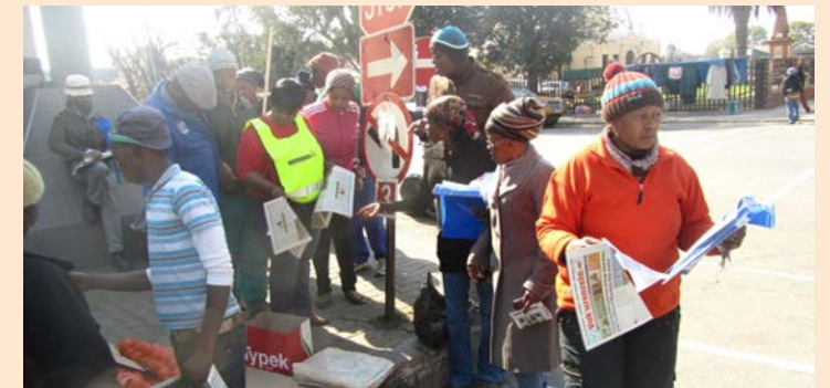
Activities for 67 minutes at the crossroad in Mahikeng on 18 July 2013.

The North West Provincial Office of the GCIS celebrated 67 minutes to inspire and taking action to change the world in making every day a Mandela Day by giving communities food for thought as part of celebrating the legacy of this icon on his 95th birthday. Two hundred Vuk'uzenzele government newspapers, 67 bursary forms from the departments of water affairs, and agriculture, forestry and fisheries and 95 of Mandela's favourite quotes were distributed during the cross-roads information activation in Mahikeng on the corner of Martin and Carrington streets.