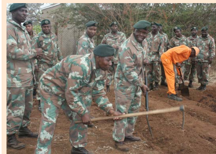
Members of SANDF 7 SAI BN volunteering their time at Ntabiseng Special School.

The United Nations declared the birthday of the ever-popular former State President, Nelson Mandela, as International Mandela Day and each year people across the world participate in various activities to celebrate the day. Mandela Day creates a platform for people to lend a hand in dealing with, among other things, poverty, unemployment and inequality. The Ba-Phalaborwa community lined up various activities such as: