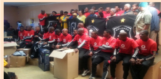
Pirates donated blankets and food parcels to the elderly.