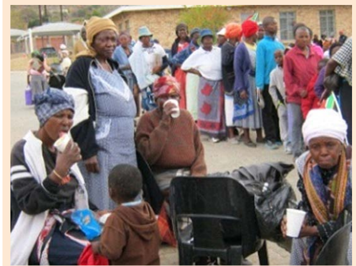
Everyone received a hot cup of soup.

Responding to the Nelson Mandela Foundation's call to volunteer 67 minutes on Mandela Day. On 18 July, Nelson Mandela's birthday, the community of Mapodile gathered at the Mapodile Thusong Service Centre to honour Madiba's birthday, leadership and humanitarian legacy by supporting their senior citizens.