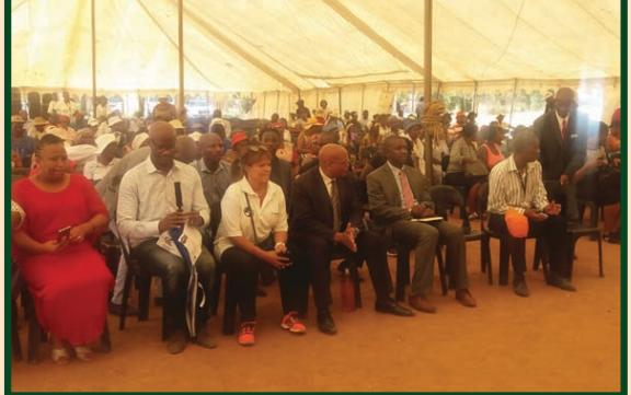
Councillor Tabane, Minister Ayanda Dlodlo, Chief Shole and Minister Faith Muthambi at the event.