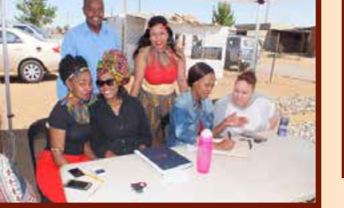
Government officials at the event.