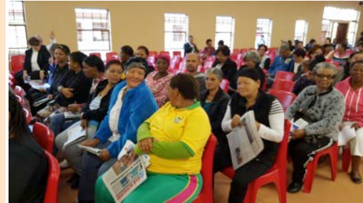
Community members at the event.