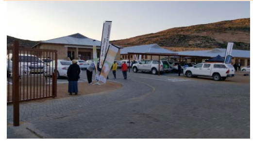
The entrance to the newly built Matjieskloof Intermediary School in the Northern Cape.