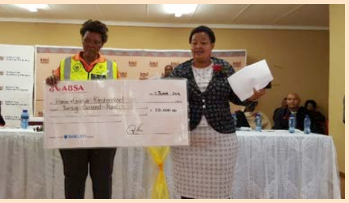
A cheque from ABSA was handed over to the creche at the school.