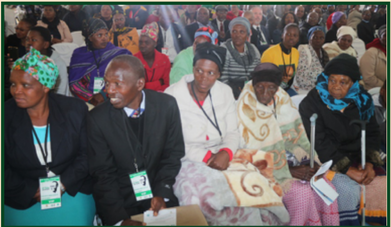
Community members during the OR Tambo Centenary celebrations.