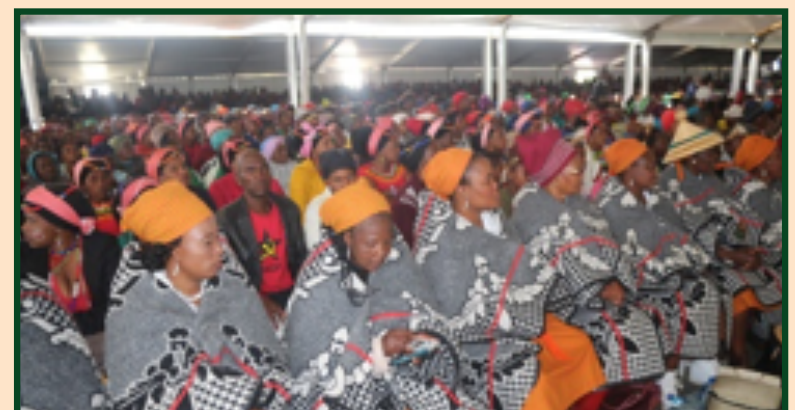
Community members listening to various speakers.