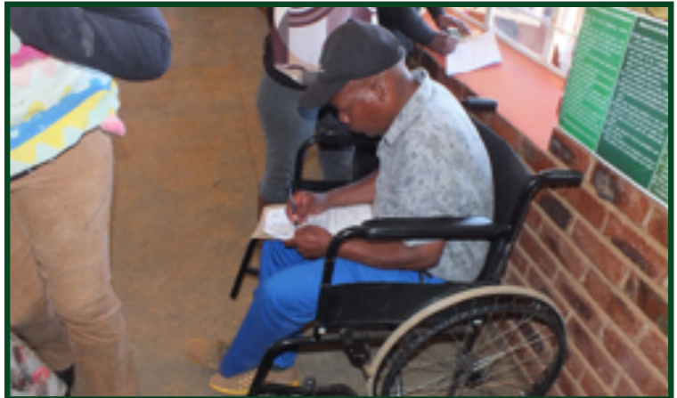
Community members attending the outreach campaign at Oblate Farm.