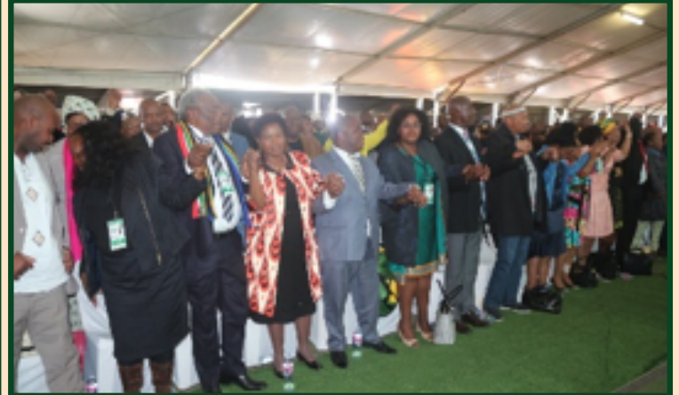
Government leaders at the event.