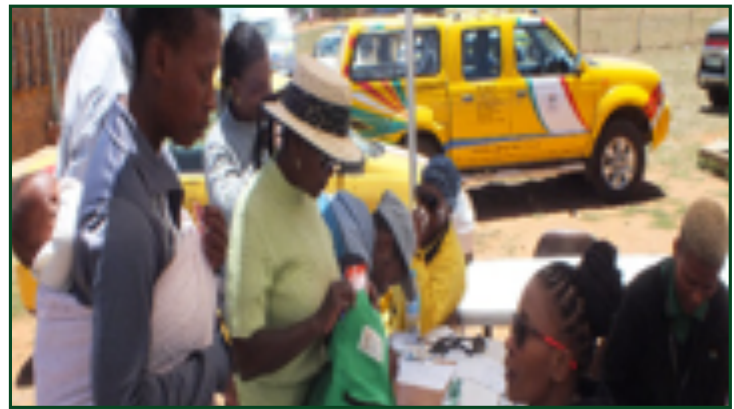
Community members accessing various government services at the event.