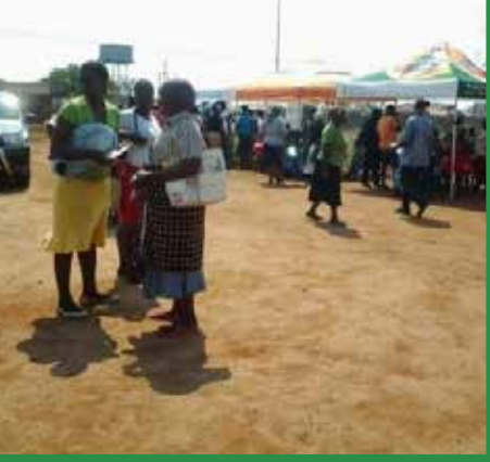
Community members visiting different exhibition stalls for information.

Mpumalanga held its annual Thusong Service Centre Week opening event through the integrated mobile services at Steenbok, in Nkomazi Local Municipality on 18 September 2018. Steenbok was identified as the area for the annual week celebration after a feasibility check was done by the Nkomazi Stakeholder Forum. It was discovered that the area has a backlog of new social grant card swap. It was noted that Steenbok communities have a huge challenge to access government services as most offices are far from them.