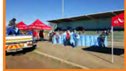
ABSA donated 45 000 litres of bottled drinking water to the community, old-age homes and the local hospital.

A warm-up session on the netball field before they tackle the opponents later during the day's activities.