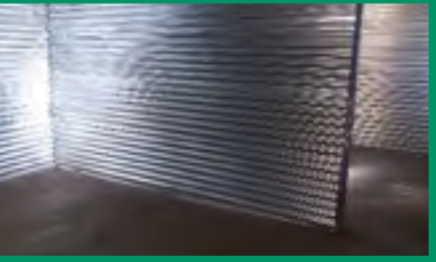
The temporary shelter given to the Kaketso family.