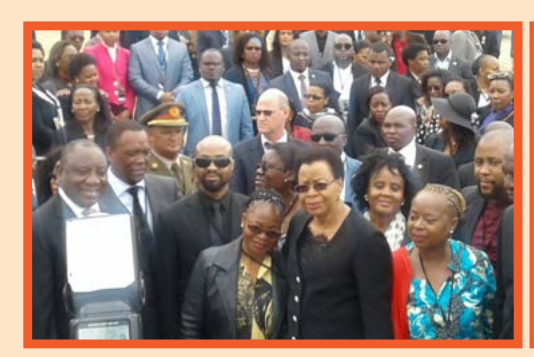
Deputy President and Prime Minister with the family of Samora Machel.