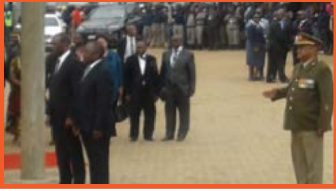
Deputy President Cyril Ramaphosa and Mozambique Prime Minister Carlos Agostinho de Rosario observing protocol during the singing of the national anthems.