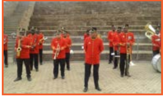
The South African National Defence Force band played Mozambican and South African national anthems.