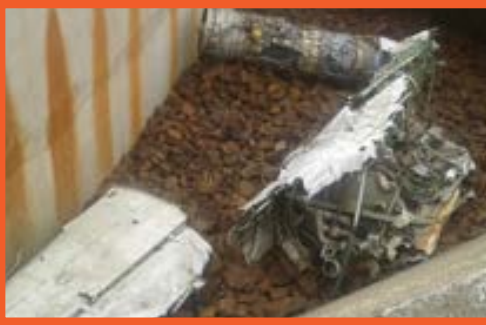
Remaining parts of the plane that killed Samora Machel.