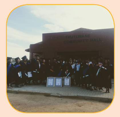
ICT 2019 graduates.