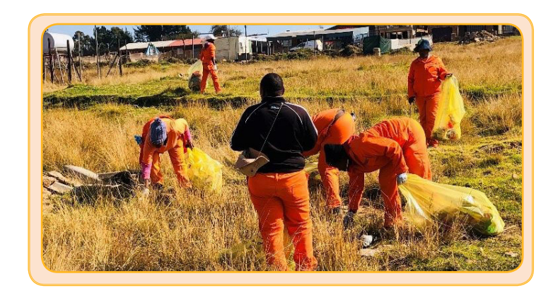
Good Green Deeds Clean-up Campaign in Sakhelwe.