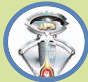
The Order of Mapungubwe