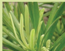
National tree: Real yellowwood