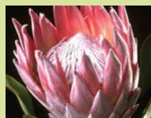
National flower: King protea