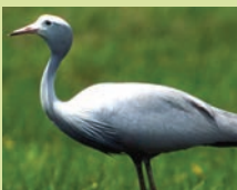
National bird: Blue crane