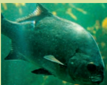
National fish: Galjoen