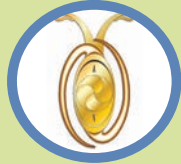
The Order of the Companions of OR Tambo