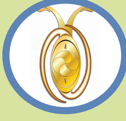
The Order of the Companions of OR Tambo