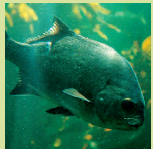
National fish: Galjoen