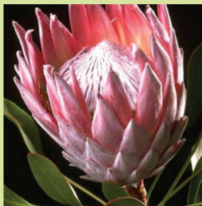
National flower: King protea