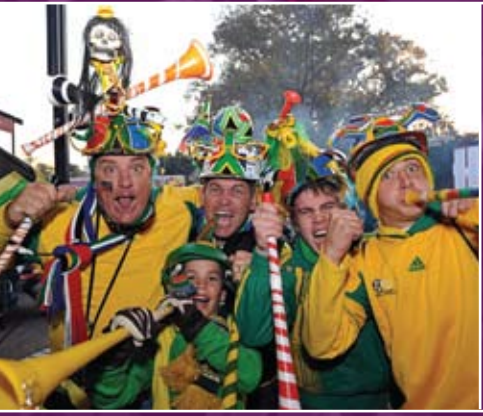
During the duration of the tournament, billions of viewers around the world watched the World Cup games and opening and closing ceremonies.