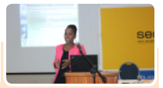
More than 200 entrepreneurs from different municipalities in the Gert Sibande District attended the informative and engagement session held at Ermelo Inn.