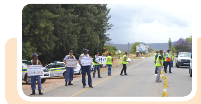
Various role players including the SAPS, the Provincial Traffic Services, CDWs and the DoC, conducting a roadblock in the fight against the abuse of women and children.

Motorists entering Clanwilliam were stopped and provided with brochures containing information about the 16 Days of Activism. Business owners from Clanwilliam who also took part in the roadblock, showed their support for the initiative and requested information products to distribute around the area.